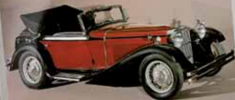
Mercedes-Benz 370 S Cabriolet A