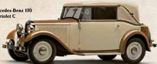
Mercedes-Benz 170 Cabriolet C