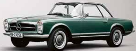
Mercedes-Benz 230 SL "Pagoda"