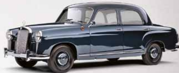
Mercedes-Benz 180 "Ponton"