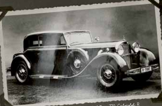
Mercedes-Benz "Grand Mercedes", Type 770, Cabriolet B

From the Mercedes-Benz engine oil Classic Edition: