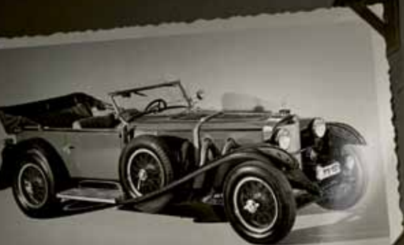
Mercedes-Benz Type S Sport four-seater