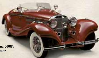
Mercedes-Benz 500K Spezial Roadster