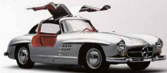
Mercedes-Benz 300 SL "Gullwing"