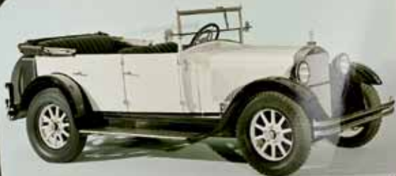
Mercedes-Benz 8/38 hp Stuttgart, open touring car