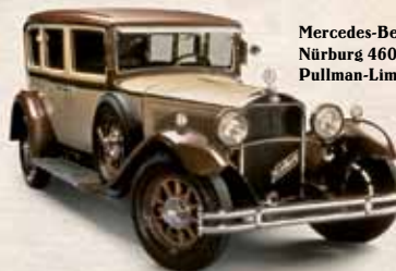
Mercedes-Benz 18/80 hp Nürburg 460 Pullman-Limousine