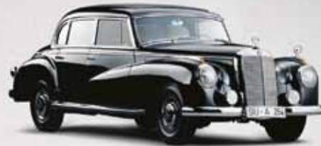
Mercedes-Benz 300 "Adenauer"