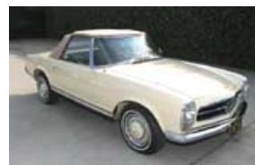
1967 230SL Ivory Concours Restored