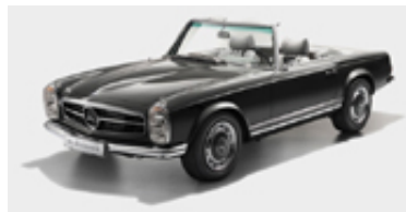
Mechatronik M-SL 4.3 liter 4-cam V8