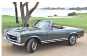
1970 280SL Moss Grn Full restoration