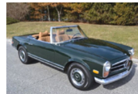
1971 280SL4-spD Dark Olive/Bamboo