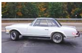
1968 280SL Survivor 76k miles, 4-spd