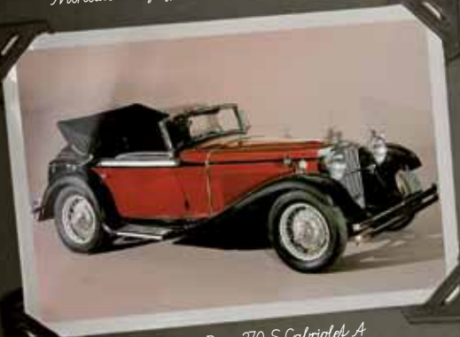
Mercedes-Benz 370 S Cabriolet A