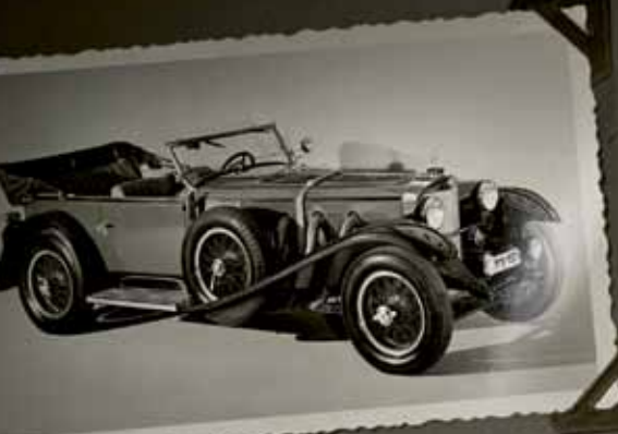
Mercedes-Benz Type S Sport four-seater